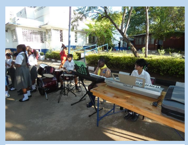
National Anthem Ensemble